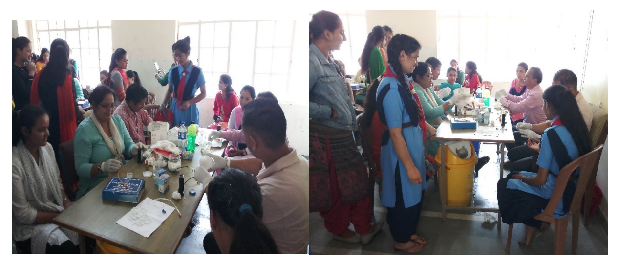
बंजार में दी पोषण अभियान की पर्यावरण बचाओं के उद्देश्य से 21